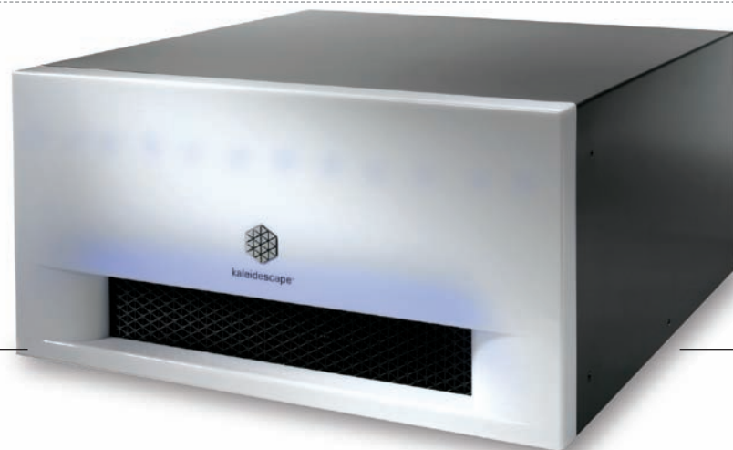
Kaleidescape System

If you're a music and movie buff and are tired of sorting through stacks of DVDs and CDs, here's your solution. Store and automatically catalog all of your media with this ingenious device. A single Kaleidescape Server can store approximately 10,000 music CDs and it distributes content throughout your home. This package includes a server, movie player, and reader. Want even more movies? You can expand your collection immensely with prepackaged movie collections (each containing hundreds of titles). Prices start at $22,000, available at kaleidescape.com .